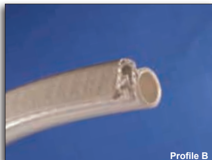
“D” Silicone Series