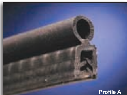
“D” EPDM Series