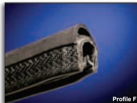
“D” PVC/EPDM Series

The Seal-Fast Edge Seal installs without the use of adhesives, is very flexible, and is available in a variety of materials which include a flexible steel or stainless steel substrate with a Silicone, EPDM, or PVC gasket allowing for fast assembly.